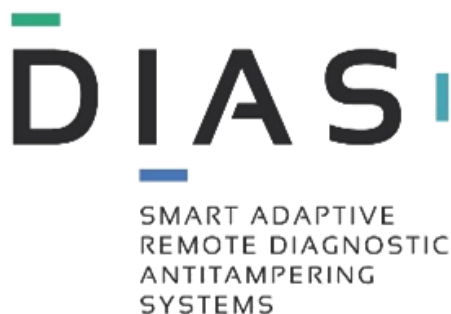
Figure 4: DIAS logo

In order to share the goals and results of the Project as well as to get a widespread attention among different users in Europe and elsewhere the following logo has been chosen